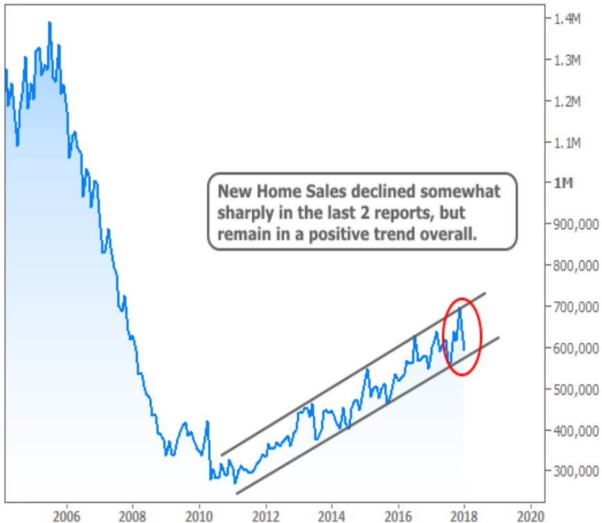
New Home Sales

Of course rates are far from the only input for home sales. As we discussed last week, inventory is an ongoing problem, as is affordability. The tariff news creates more uncertainty on that front. Tariffs could increase building costs and hinder the construction of affordable homes, according to Lawrence Yun, chief economist of the National Association of Realtors.