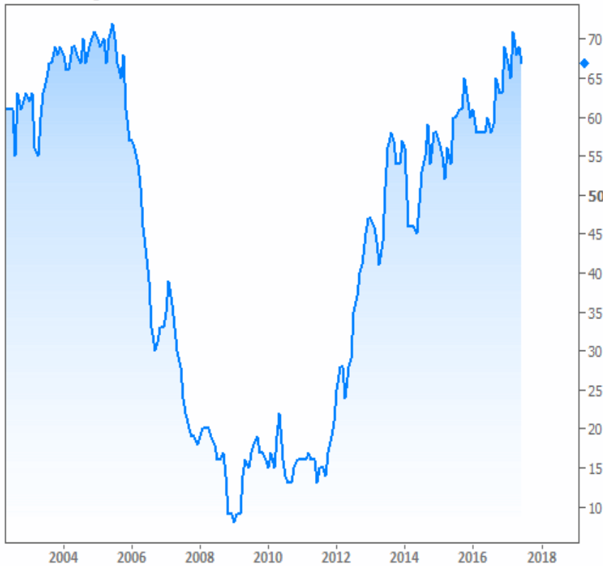
NAHB Housing Market Index

It's harder to offer a compelling counterpoint for Friday's New Residential Construction data from the Census Bureau. Both Housing Starts and Builder Permits came in well below forecasts, prompting National Association of Realtors' Chief Economist to say "housing shortages look to intensify and may well turn into a housing emergency if the discrepancy between housing demand and housing supply widens further."