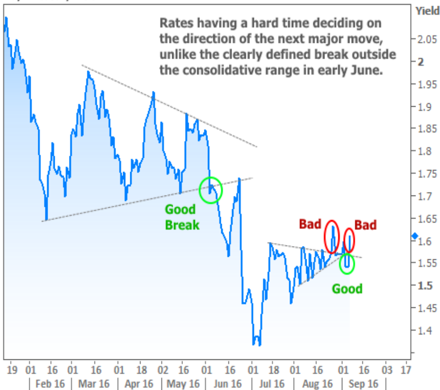
10yr Treasury Yield

Conventional market wisdom holds that rates tend to make bigger moves when they break out of these patterns. Early June was a classic example (as seen in the following chart). But the more recent example is having a hard time making up its mind.