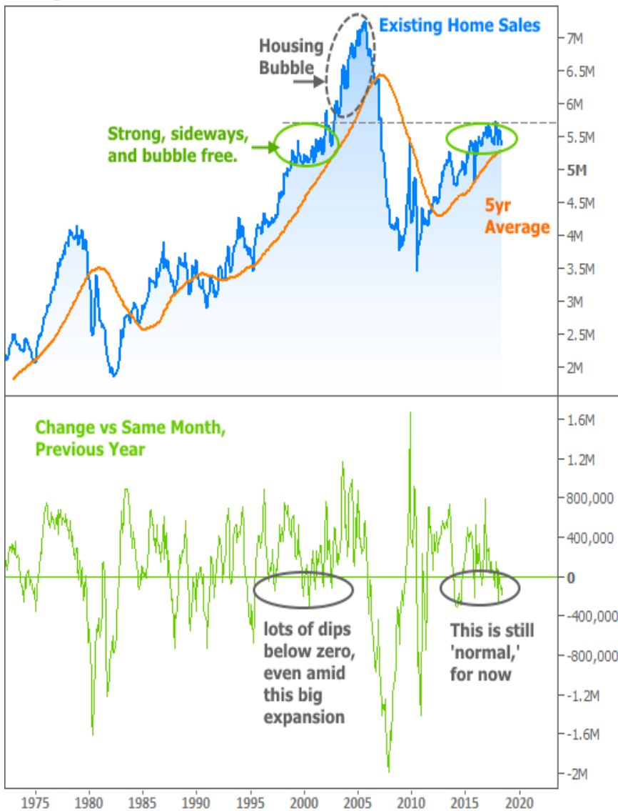
Existing Home Sales

Whereas it might require a deep breath and some perspective to feel optimistic about existing sales, New Home Sales are still very clearly in a linear uptrend. They just happen to be experiencing a move lower INSIDE that trend--one that they've seen at least 4 times in the past 5 years. In fact, the periodic corrections of the past few years are clearly milder than those seen during the previous expansion (as seen at the bottom of the following chart).