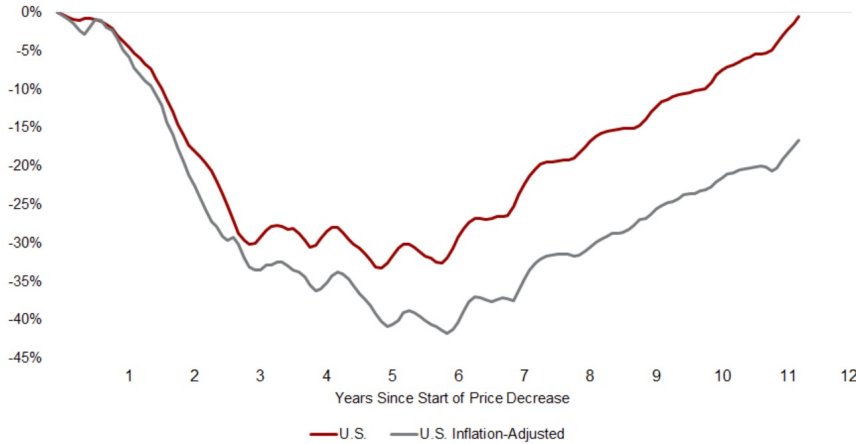
Change in Home Price Index Since Start of Declines (2006)

Boesel says inflation should also be factored into the pace of recovery. From the peak in housing prices through this past July, the inflation has totaled just under 18 percent. When home prices are adjusted for that, the trough was deeper , down 40 percent from the beginning of the cycle, and the recovery shallower; prices remain 17 percent off the peak.