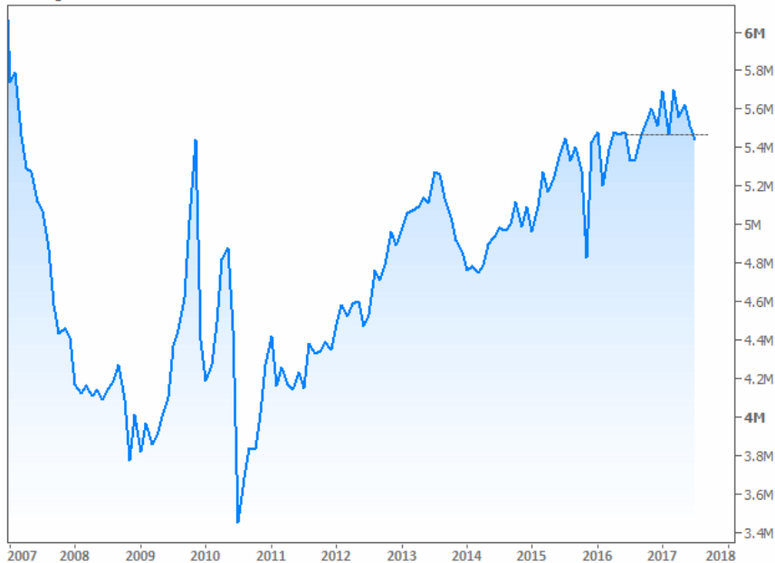
Existing Home Sales

Single-family home sales decreased 0.8 percent to a seasonally adjusted annual rate of 4.84 million from 4.88 million in June and were 1.7 percent above the 4.76 million pace a year ago. Existing condominium and co-op sales fell 4.8 percent to a seasonally adjusted annual rate of 600,000 units in