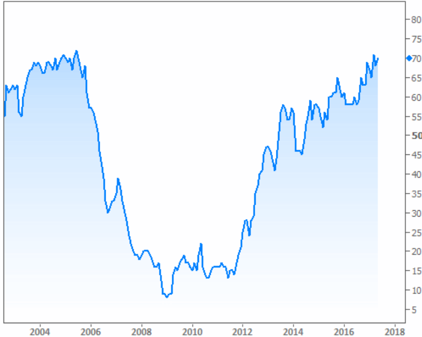
Housing Market Index

The Index is based on a monthly survey NAHB conducts among its new homebuilder members. They are asked to provide three measures of their confidence in the homebuilding market; a gauge of their perceptions of current single-family home sales and their expectations for sales over the next six months on a scale of "good," "fair" or "poor" and to rate traffic of prospective buyers as "high to very high," "average" or "low to very low." Scores for each component are then used to calculate a seasonally adjusted index where any number over 50 indicates that more builders view conditions as good than poor.