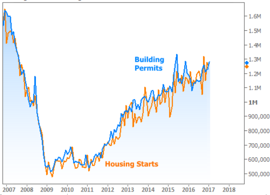
Housing Starts vs Building Permits

Construction permits were issued at a seasonally adjusted annual rate of 1,285,000, up 4.6 percent from the December rate of 1,228,000. The latter number was a revision from the 1,210,000 units previously announced. On a year-over-year basis permitting posted an 8.2 percent increase over the previous January's pace of 1,188,000.