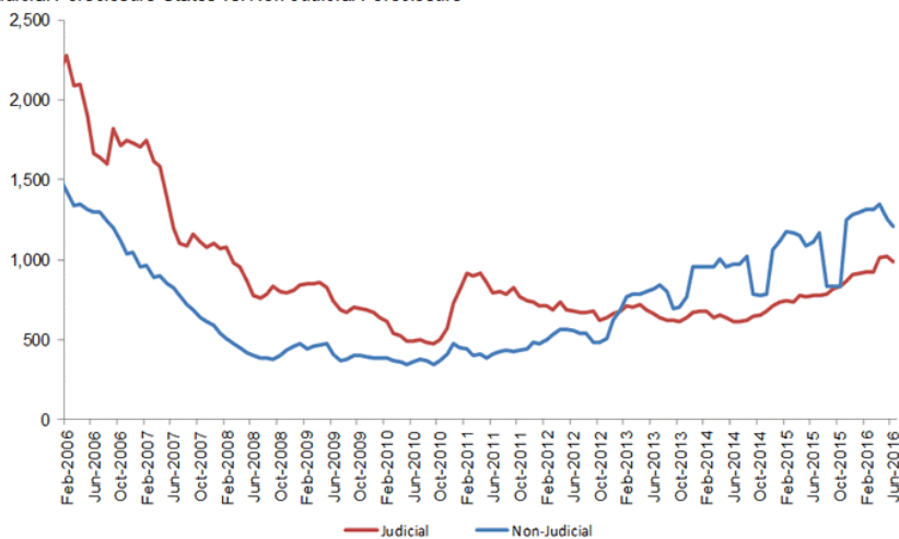
Figure 1 – Number of Mortgaged Homes per Completed Foreclosure Judicial Foreclosure States vs. Non-Judicial Foreclosure

Completed foreclosures increased by 5.1 percent to 38,000 in June 2016 from the 36,000 reported for in May. As basis of comparison, CoreLogic says completed foreclosures averaged 21,000 per month nationwide between 2000 and 2006 before the housing downturn began.