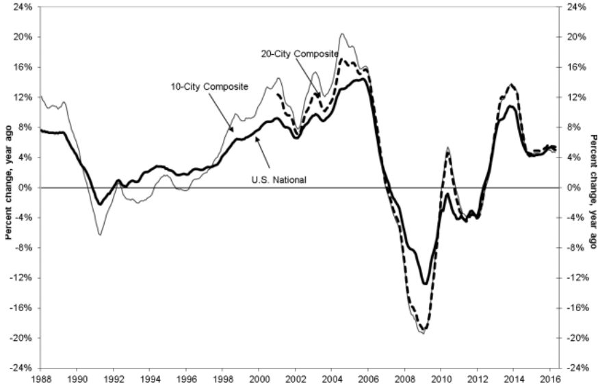
S&P/Case-Shiller Home Price Indices

Source: S&P Dow Jones Indices & CoreLogic