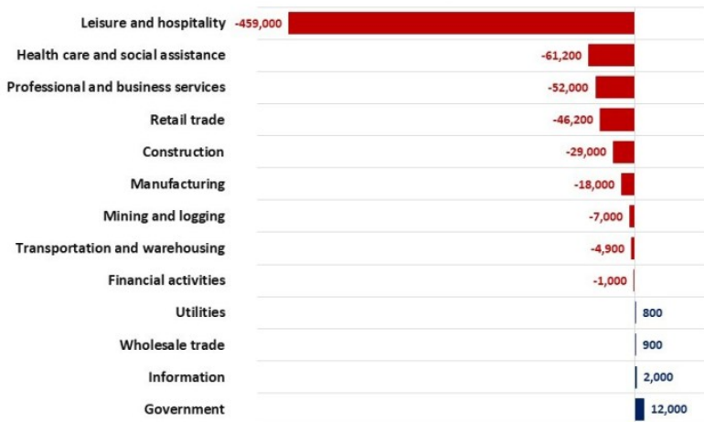
Figure 2. March Employment Changes by Selected Industry (month-over-month change)

Employment in residential construction had been doing well, it was up by 24,100 in February, but that reversed in March, undoubtedly due to impacts from the COVID-19 pandemic , and 4,300 jobs were lost. The total loss across all construction categories was 29,000 jobs. Those losses, however, paled in comparison to the massive ones in the leisure and hospitality industry as hotels shut down, restaurants closed, and cruises were cancelled. Three other job categories also pulled back more dramatically than construction.