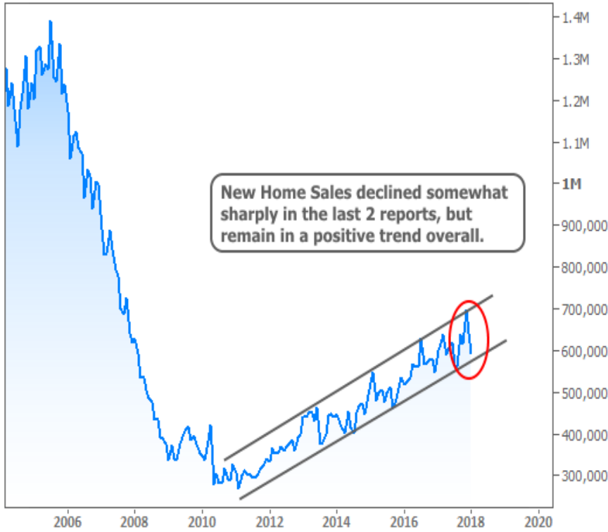
New Home Sales

Of course rates are far from the only input for home sales. As we discussed last week, inventory is an ongoing problem, as is affordability. The tariff news creates more uncertainty on that front. Tariffs could increase building costs and hinder the construction of affordable homes, according to Lawrence Yun, chief economist of the National Association of Realtors.