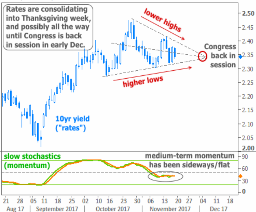
US 10yr Treasury Yield

In the spirit of "waiting and seeing," interest rates improved slightly this week. This keeps them locked in a consolidative trend (higher lows and lower highs) that's been underway for more than a month. It's the bond market's way of expressing indecision, and for now, the trend suggests indecision could linger at least through early December. Even if we apply some esoteric math to recent rate movement and derive a line that measures momentum, that line has been almost perfectly flat for several weeks.