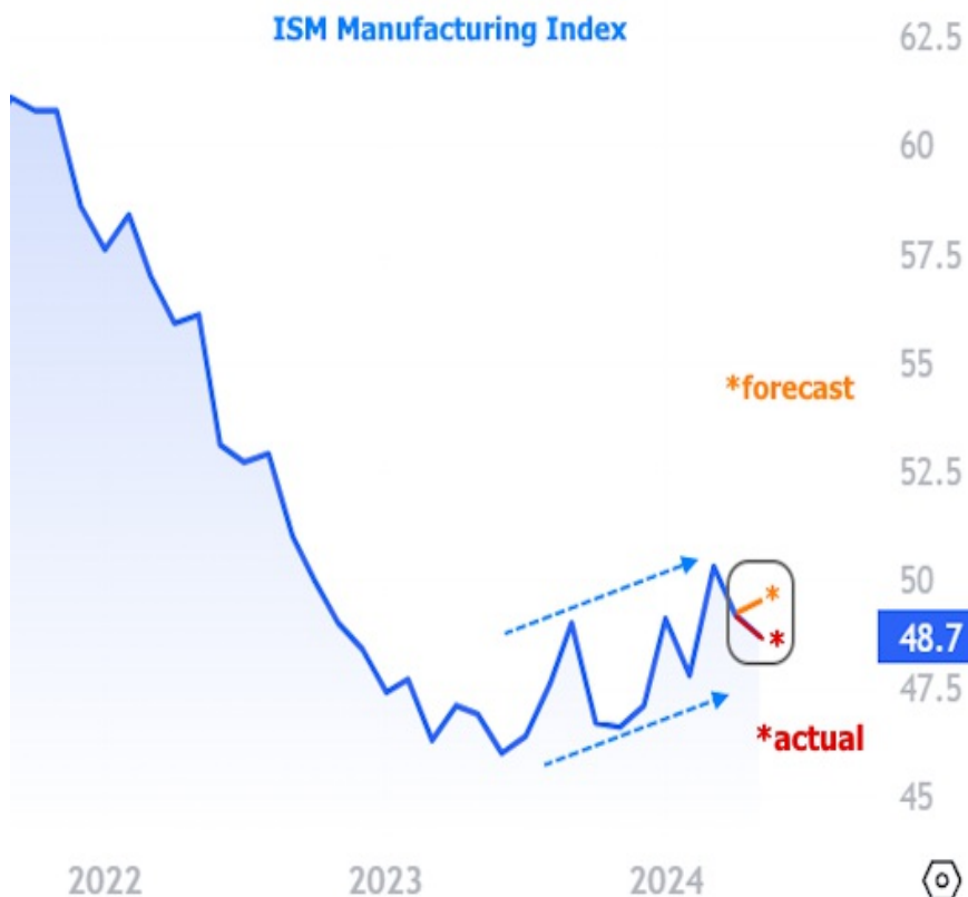
ISM Manufacturing Index

In fact, the size of the reaction to Monday's ISM data is one of the best reasons to investigate other variables. These could include follow-through momentum from last Friday's rate-friendly reaction to the PCE inflation data as well as more esoteric motivations surrounding the change of one calendar