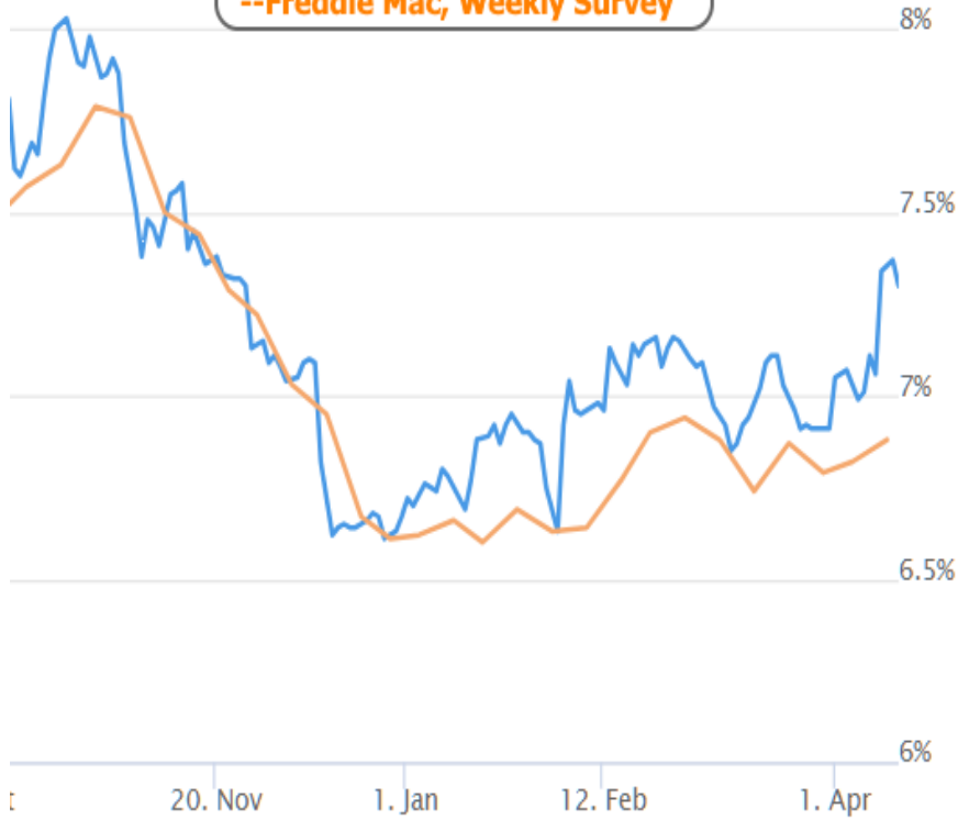
Mortgage Rate Indices --MND, Actual Daily Average --Freddie Mac, Weekly Survey

Why did we see such a big reaction for such a small deviation in the data? Simply put, the market keeps waiting for a trend toward lower inflation to resume and the data keeps breaking hearts. This week's report was sort of a "third times the charm" moment. Jan and Feb CPI (released in Feb and Mar, respectively) were also surprisingly high. They did damage to rates to be sure, but markets and even officials from the Federal Reserve were hoping those reports were outliers.