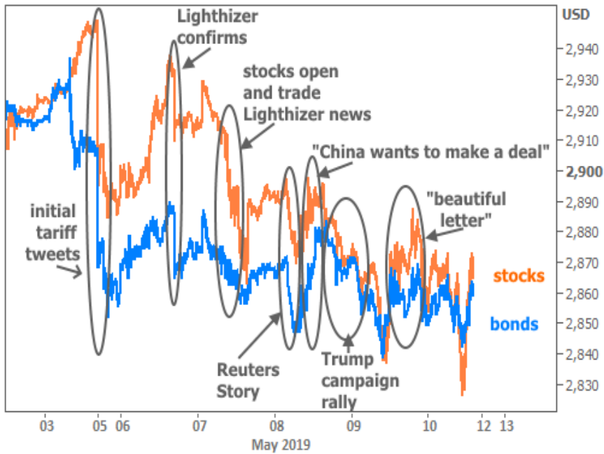
Rates vs Stocks

Before this fairly wild week, it looked like rates had decided to move higher after being unable to break below key levels last week due to Fed Chair Powell's press conference on Wednesday. Stocks didn't love what they heard from Powell but were nonetheless able to hold near all-time highs.