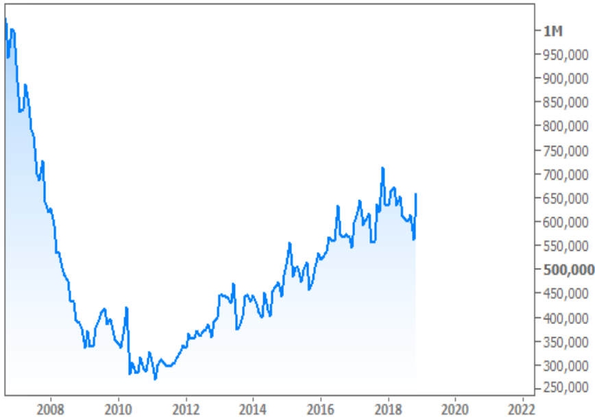
New Home Sales

In the same report, median prices of new homes had a completely different experience. They fell sharply.