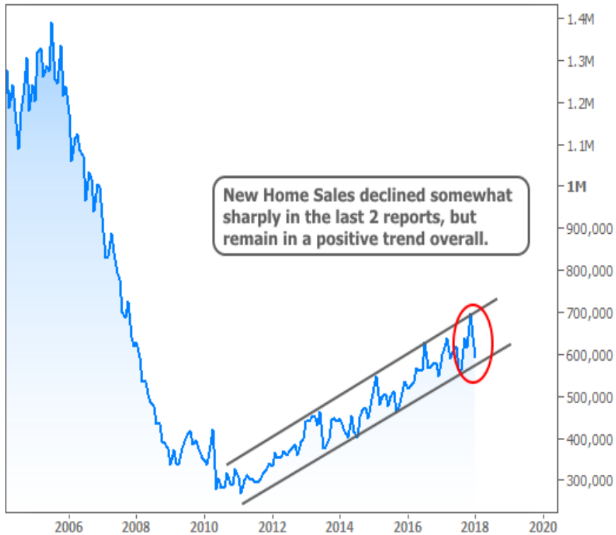
New Home Sales

Of course rates are far from the only input for home sales. As we discussed last week, inventory is an ongoing problem, as is affordability. The tariff news creates more uncertainty on that front. Tariffs could increase building costs and hinder the construction of affordable homes, according to Lawrence Yun, chief economist of the National Association of Realtors.