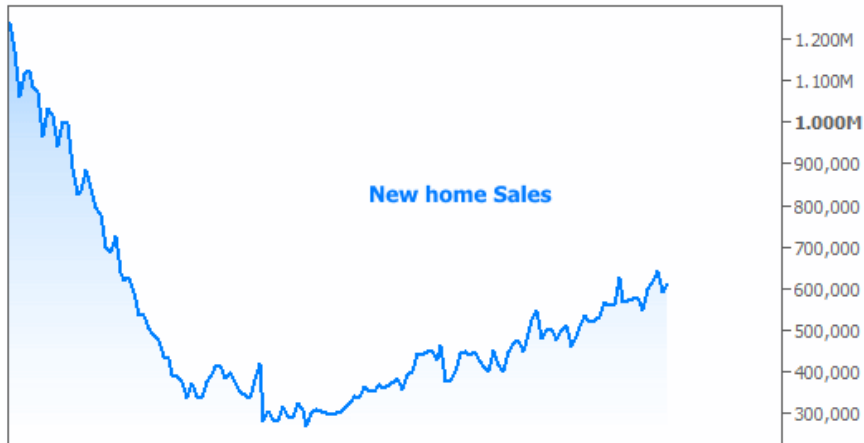
New home Sales