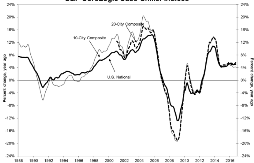
S&P CoreLogic Case-Shiller Indices