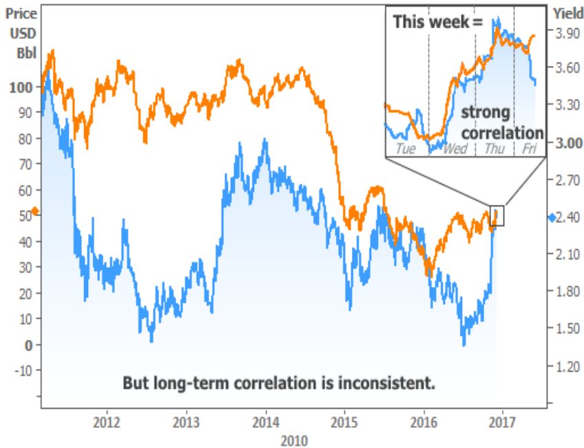
Rates vs Oil

Oil prices do indeed have strong correlations with interest rate movements. This week was a good example of that, as we'll see in the following chart. But the chart also shows that this week's correlation is a small drop in a much bigger bucket.