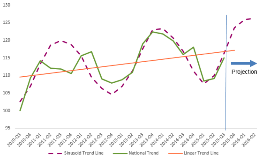
Figure 1: National Mortgage Application Fraud Index