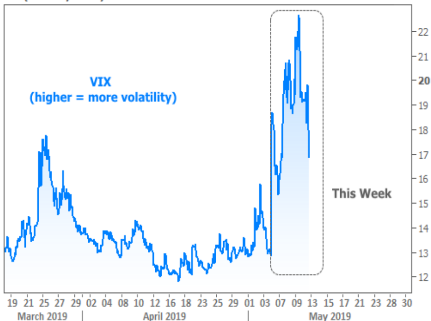
VIX (volatility index)

The big spike right out of the gate suggests that markets were reacting to news that hit over the weekend. Indeed, the culprit was a set of Trump tweets about raising tariff's on Chinese goods. Combined with a story from the Wall Street Journal suggesting China was considering "pulling out of trade talks," the message to markets was clear : something had gone wrong in the trade negotiation process.