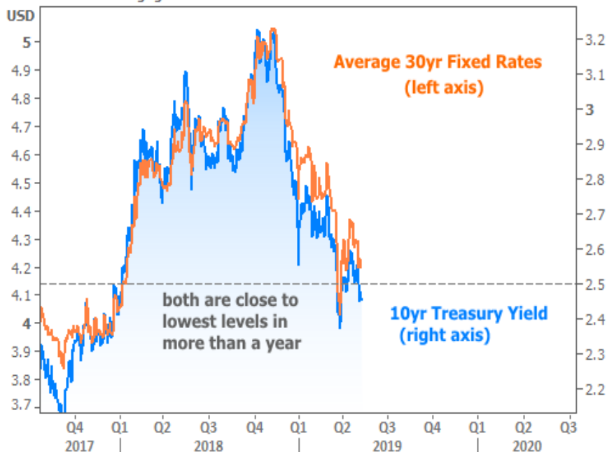
Treasuries vs Mortgage Rates

The week ahead should be telling for markets as traders are able to get back to business following this week's trade war diversions. Economic data will return after being mostly absent or inconsequential this week. In that regard, next Wednesday's Retail Sales report is likely the most important data point followed by a smattering of other mid-tier reports in the 2nd half of the week.