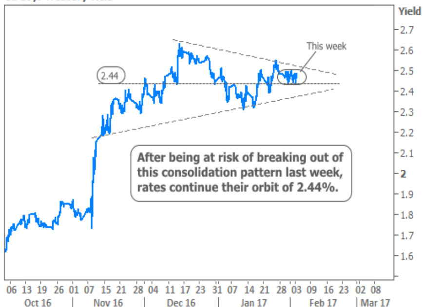
US 10yr Treasury Yield

In addition to the Fed, there were several important economic reports this week. Chief among those was Friday's nonfarm payrolls data (the big "jobs report"). Although payroll growth outpaced expectations, wage growth not only fell short, but was also revised lower for the previous month. Wage metrics are closely-watched by both markets and the Fed right now, with the expectation being that rising wages will stoke inflation and thus, faster rate hikes. The weak wage data helped rates hold their ground.