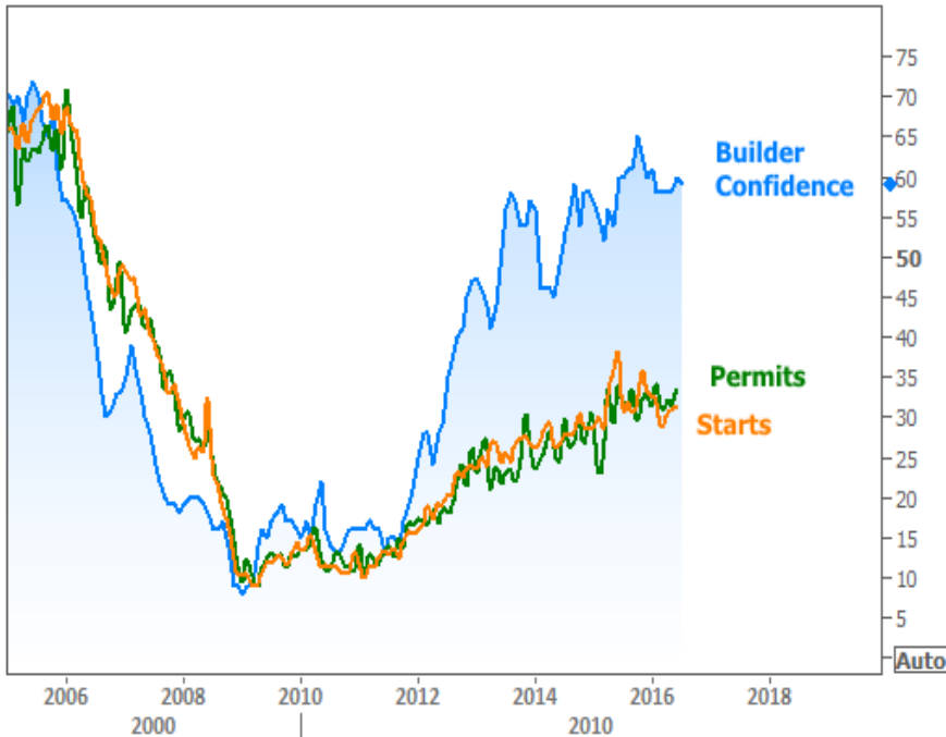
Builder Confidence, Housing Starts, Building Permits

The answer will likely vary depending on your individual outlook on the economy and the housing market. There are several forces at work here. One of the most frequently-cited is that it's simply in builders' best interest to build fewer, bigger houses for economic reasons. The other major consideration is the relative boom in multifamily construction. Both of these would help explain builders' ability to remain much more upbeat than residential construction numbers would suggest.