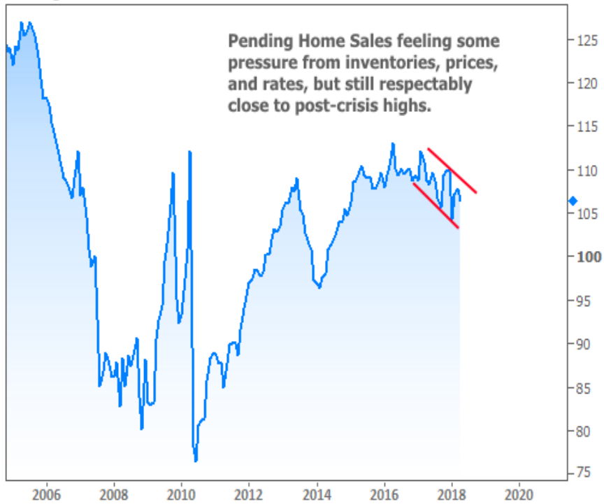
Pending Home Sales

Subscribe to my newsletter online at: http://housingnewsletters.com/potomacmortgageadvisors