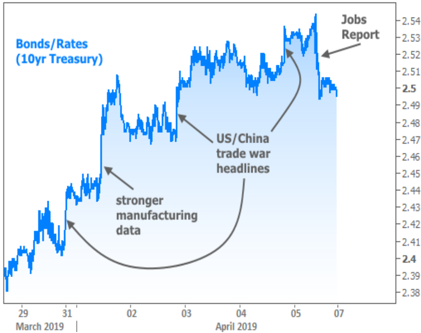
What Moved Rates This Week?

US trade policy will remain in focus, but markets will add Fed policy to the agenda for next week. Wednesday afternoon brings the Minutes from the most recent Fed meeting. This gives investors a deeper look at the discussion that resulted in the Fed's surprising announcement on March 20th. On the same day, the EU holds an emergency summit to decide if the Brexit saga will continue. And it almost certainly will, but if for some unforeseen reason Britain finds itself unable to negotiate another extension, rates would likely drop in response.