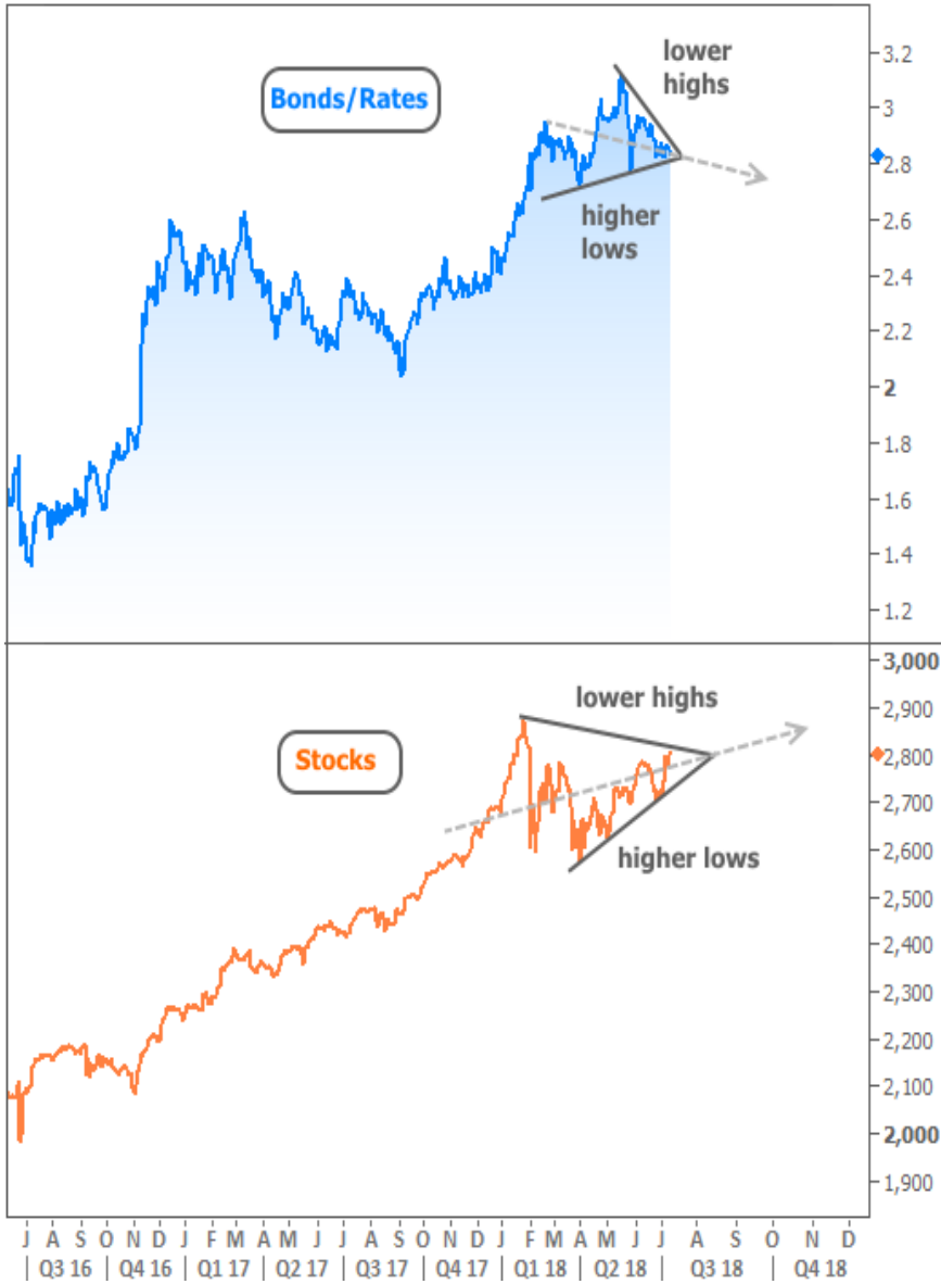
Stocks vs Bonds

In other words, neither side of the market is telling the truth OR lying. Both still aren't exactly sure which way the next move will go. If past precedent is any guide, we may be waiting to find out conclusively until the summertime trading slowdown ends in September. Either way, the presence of these consolidations greatly increases the odds of a bigger move on the horizon.