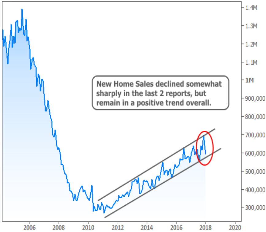
New Home Sales

Of course rates are far from the only input for home sales. As we discussed last week, inventory is an ongoing problem, as is affordability. The tariff news creates more uncertainty on that front. Tariffs could increase building costs and hinder the construction of affordable homes, according to Lawrence Yun, chief economist of the National Association of Realtors.