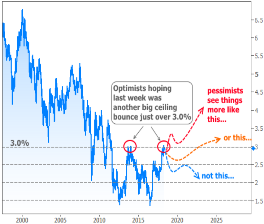
US 10yr Yield

Bonds are also at a crossroads, having just lived through their 2nd encounter with the most important rate ceiling in more than 10 years. We've already discussed reasons that 3% shouldn't be as firm of a ceiling when comparing the present situation to that seen in 2013/2014, but some investors are still holding out hope. Granted, it COULD happen if the bigger picture gets cloudy enough, quickly enough, but the 2 pessimistic scenarios in the following chart of 10yr yields are also on the table.