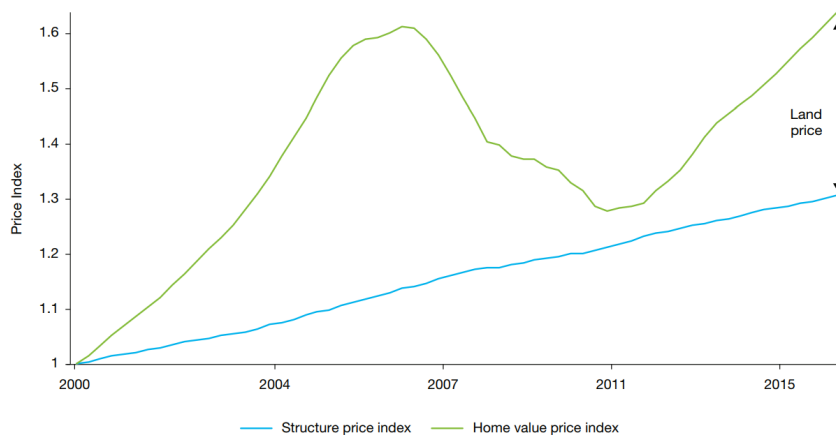
Share of land price in home value