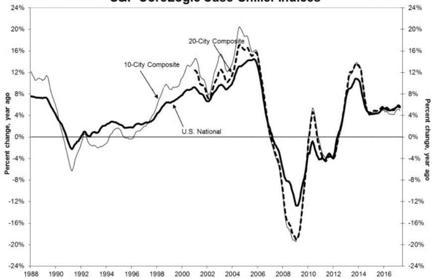
S&P CoreLogic Case-Shiller Indices

Sources: S&P Dow Jones Indices & CoreLogic