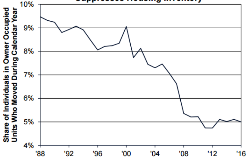
Historically Low Homeowner Mobility Rate Suppresses Housing Inventory

Residential spending rose in November, confirming expectations of a strong rebound in residential investment in the fourth quarter after two straight quarterly declines. However, for all of 2016 homebuilding was a disappointment; housing starts grew at just half the 10.8 percent pace in 2015 rather than meeting expectations that growth would hold steady. Lack of skilled labor and available building sites along with the increased cost of mortgage lending contributed to the poor homebuilding performance.