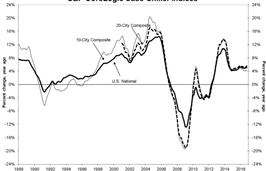
S&P CoreLogic Case-Shiller Indices

Sources: S&P Dow Jones Indices & CoreLogic