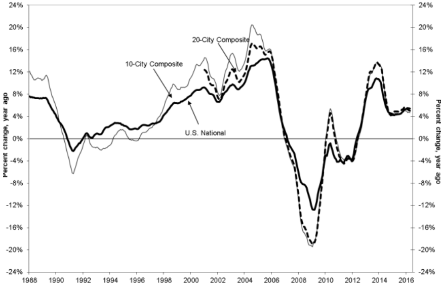
S&P/Case-Shiller Home Price Indices