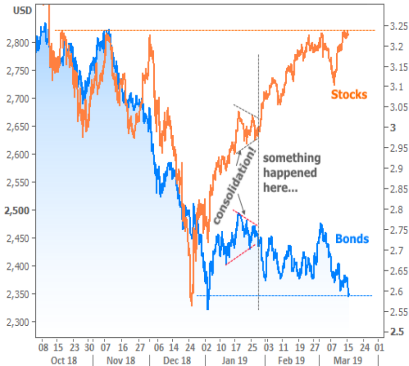
Rates vs Stocks

No, the Fed isn't getting ready to unveil another quantitative easing (QE) package, at least not directly. Indirectly, however, markets are about to feel the same sort of QE-driven euphoria. In fact, they've been feeling it for a few months now.