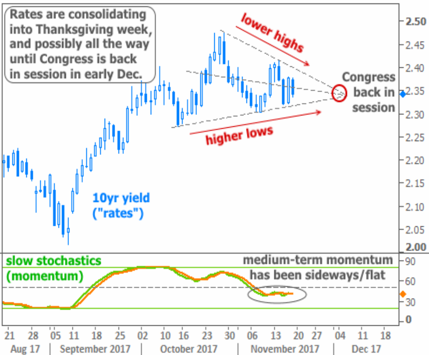
US 10yr Treasury Yield

In the spirit of "waiting and seeing," interest rates improved slightly this week. This keeps them locked in a consolidative trend (higher lows and lower highs) that's been underway for more than a month. It's the bond market's way of expressing indecision, and for now, the trend suggests indecision could linger at least through early December. Even if we apply some esoteric math to recent rate movement and derive a line that measures momentum, that line has been almost perfectly flat for several weeks.