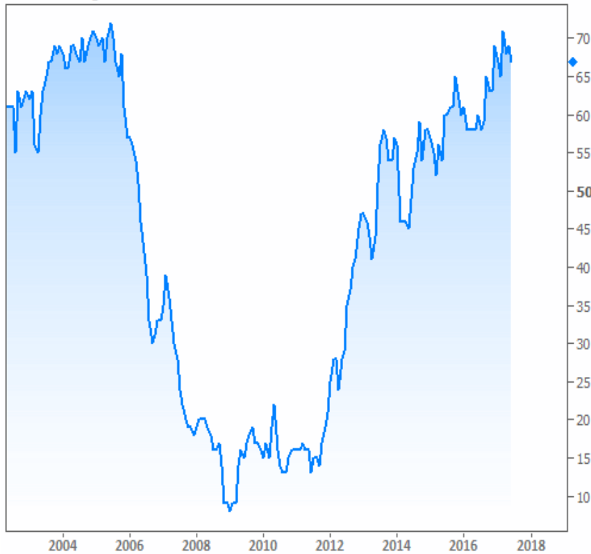
NAHB Housing Market Index

It's harder to offer a compelling counterpoint for Friday's New Residential Construction data from the Census Bureau. Both Housing Starts and Builder Permits came in well below forecasts, prompting National Association of Realtors' Chief Economist to say "housing shortages look to intensify and may well turn into a housing emergency if the discrepancy between housing demand and housing supply widens further."