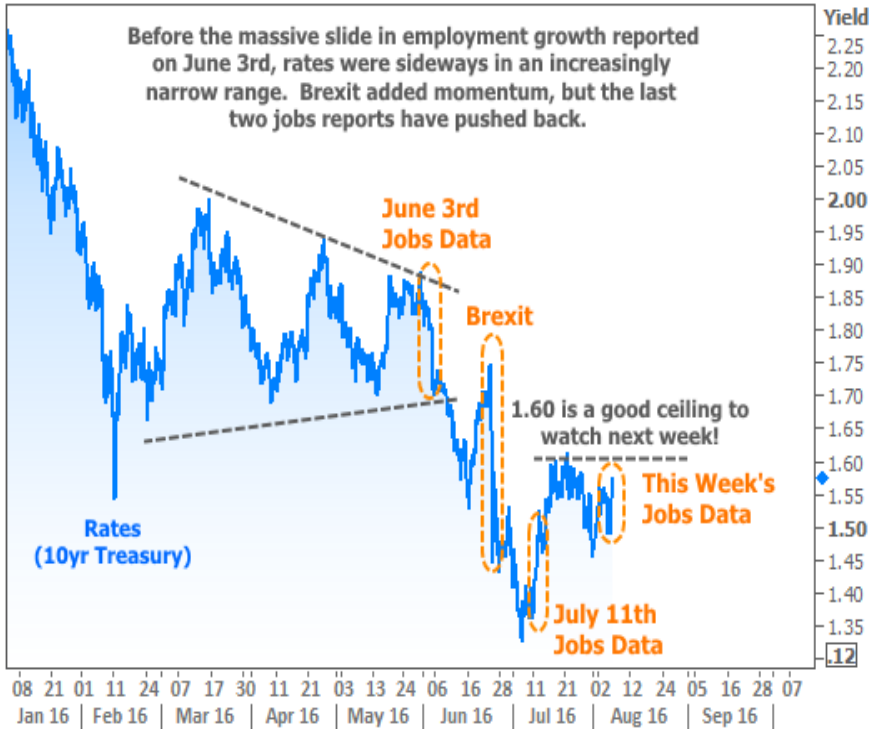
Rate Momentum Heading Into August

Now that we have a 2nd consecutive jobs report coming in so strong, the question is: will the upward momentum in rates be that much stronger? In considering that possibility, it will be useful to keep an eye on the low 1.6% range in 10yr Treasury yields, as that has been an important ceiling recently. When rates continually bounce against such ceilings, it's the market's way of letting us know it would be important if the ceiling ends up being broken.