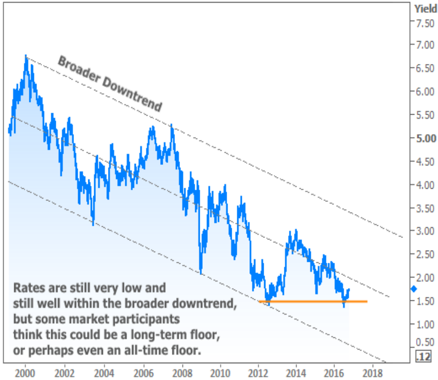
10yr Treasury Yields

Subscribe to my newsletter online at: http://housingnewsletters.com/mcateeteam