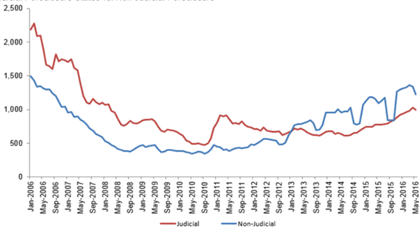
Figure 1 – Number of Mortgaged Homes per Completed Foreclosure Judicial Foreclosure States vs. Non-Judicial Foreclosure

The company's May 2016 National Foreclosure Report also shows the number of completed foreclosures nationwide decreased from 41,000 in May 2015 to 38,000 in the most recent period and were 67.9 percent below the September 2010 peak of 117,813. However, there were 2,000 more completed foreclosures in May than in April and the incidence is still running well above the 21,000 foreclosure average in the years preceding the housing crisis. There were 461,638 Foreclosures in the 12-month period ended in May 2016 compared to just over 560,000 in the 12-month period ended a year earlier.