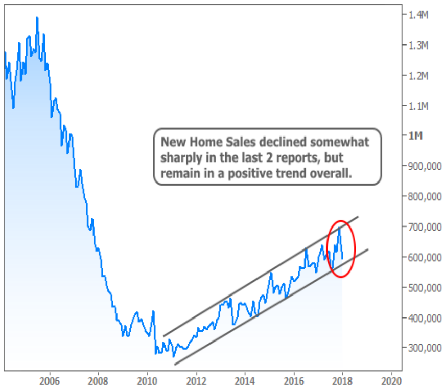
New Home Sales

Of course rates are far from the only input for home sales. As we discussed last week, inventory is an ongoing problem, as is affordability. The tariff news creates more uncertainty on that front. Tariffs could increase building costs and hinder the construction of affordable homes, according to Lawrence Yun, chief economist of the National Association of Realtors.