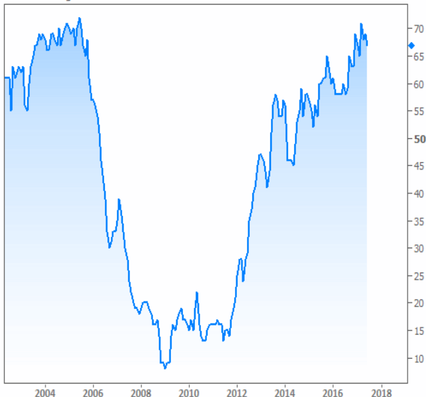
NAHB Housing Market Index

It's harder to offer a compelling counterpoint for Friday's New Residential Construction data from the Census Bureau. Both Housing Starts and Builder Permits came in well below forecasts, prompting National Association of Realtors' Chief Economist to say "housing shortages look to intensify and may well turn into a housing emergency if the discrepancy between housing demand and housing supply widens further."