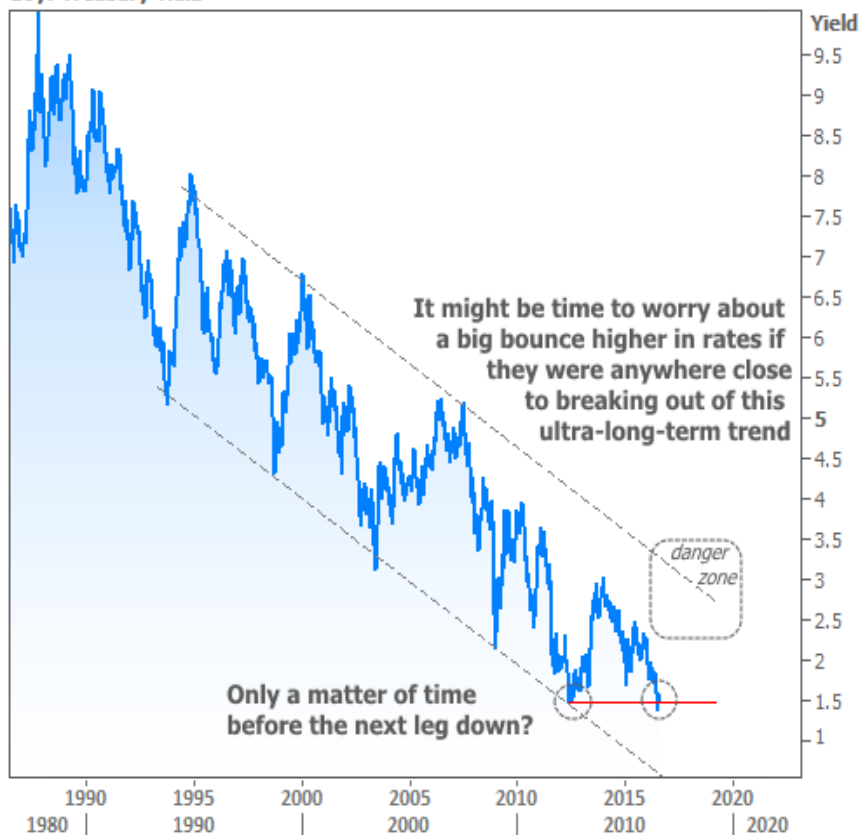
10yr Treasury Yield

Not only are we not even close, it would be easier to argue an impending move to new all-time lows. To be clear, rates can always move higher. I'm merely saying that, based on the charts, the decades-long trend toward lower rates is alive and well . People have been forecasting its demise for years, but it's not time to freak out yet.