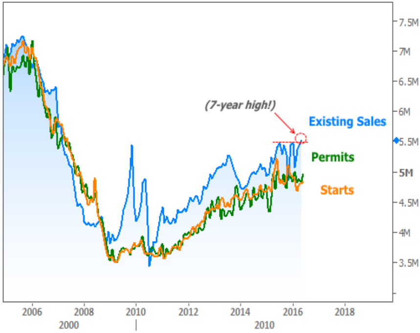
Existing Home Sales, Housing Starts, Building Permits

How concerned should we be about this lack of progress in construction activity?