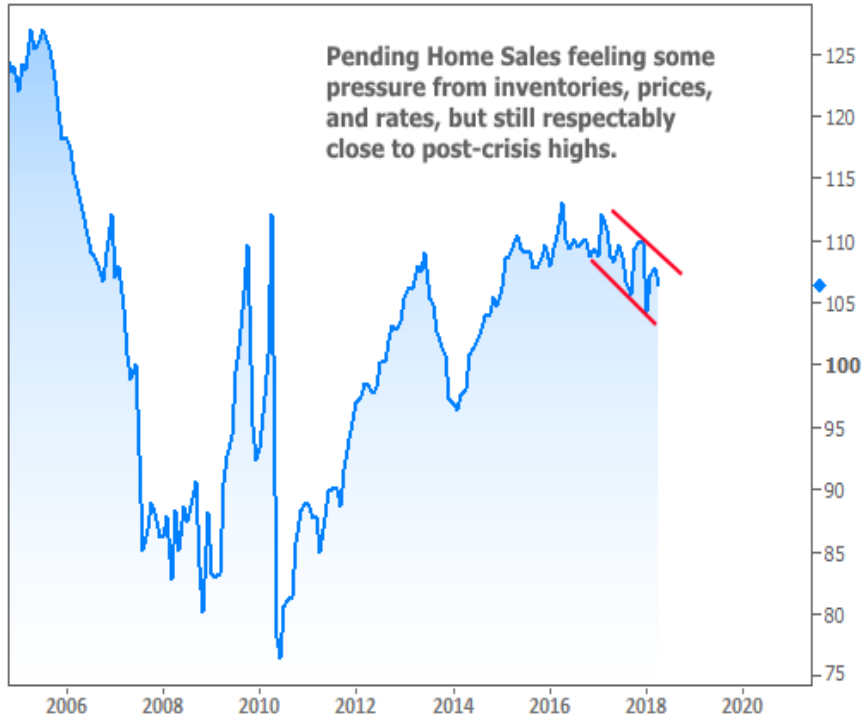
Pending Home Sales

Subscribe to my newsletter online at: http://housingnewsletters.com/marketupdates