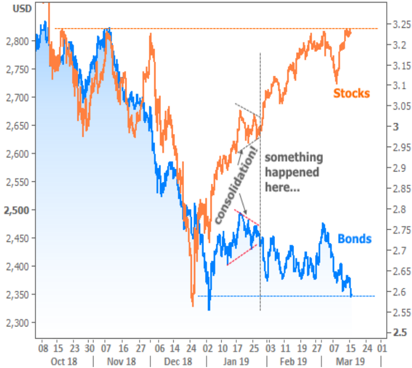
Rates vs Stocks

No, the Fed isn't getting ready to unveil another quantitative easing (QE) package, at least not directly. Indirectly, however, markets are about to feel the same sort of QE-driven euphoria. In fact, they've been feeling it for a few months now.