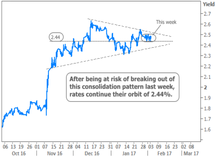
US 10yr Treasury Yield

In addition to the Fed, there were several important economic reports this week. Chief among those was Friday's nonfarm payrolls data (the big "jobs report"). Although payroll growth outpaced expectations, wage growth not only fell short, but was also revised lower for the previous month. Wage metrics are closely-watched by both markets and the Fed right now, with the expectation being that rising wages will stoke inflation and thus, faster rate hikes. The weak wage data helped rates hold their ground.