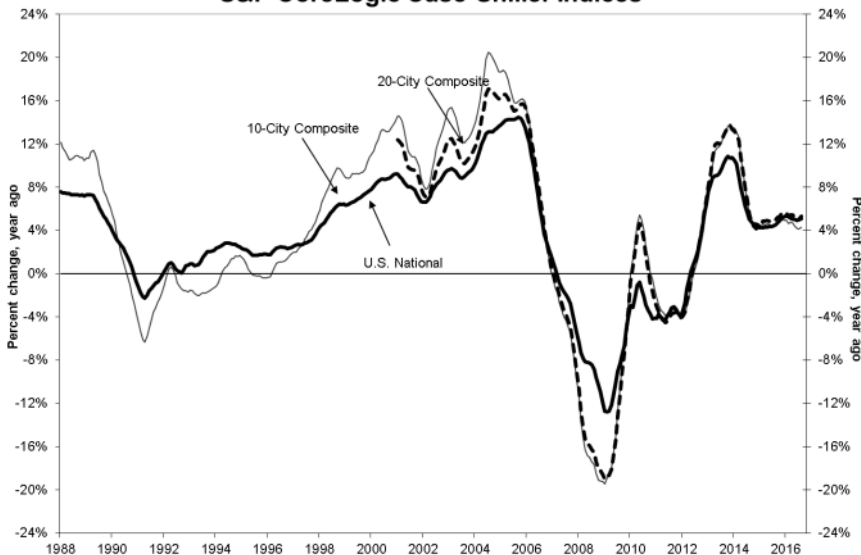
S&P CoreLogic Case-Shiller Indices

Sources: S&P Dow Jones Indices & CoreLogic