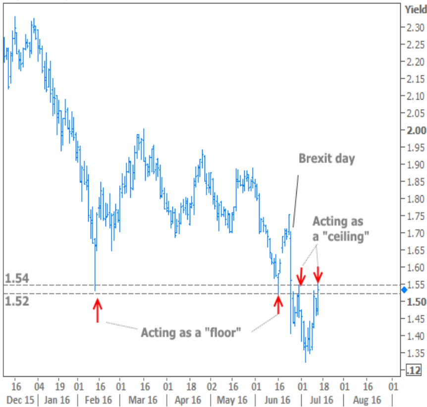
10yr Treasury Yields

Of course, when it comes to financial markets, repetitions of past patterns won't always predict the future. However, repetition does build a case for a certain level being significant. It's as simple as this: if rates hardly ever break through a given level, it's easier to argue that it means something when they do.